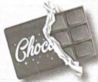
CANDY BAR WRAPPERS