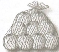
NET OR MESH PRODUCE BAGS