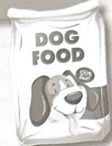
PET FOOD BAGS