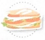
Ziploc & other reclosable food storage bags